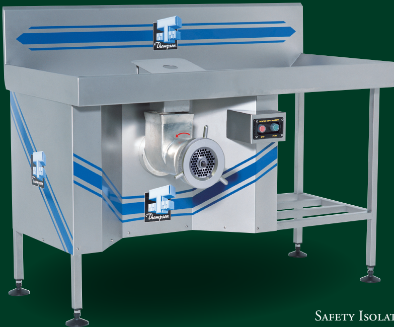
THOMPSON 42 UNDER BENCH MINCER

STAINLESS STEEL BARREL, FEEDSCREW & LOCK RING