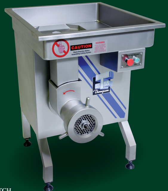
THOMPSON 42 MINCER

REMOVABLE TWIST BARREL To allow easy cleaning and sanitation